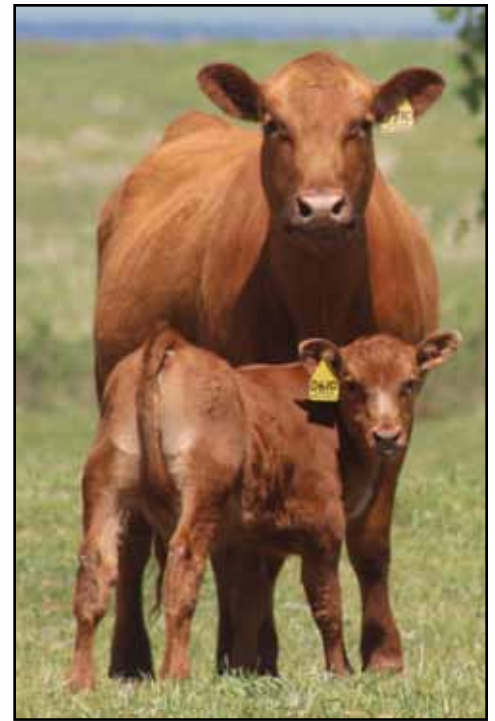
Independent research studying five years of Superior Livestock Auction data confirms the value of Red Angus replacement females.

Over the years, stockmen have voted with their checkbooks, purchasing heifers they know will bring profitability to their ranching businesses – and Red Angus females are their most-favored choice. ■