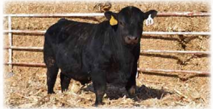
YRA Sig Sauer 736-0104 - Sire of Lots 14-22

Sig Sauer is the picture of consistency, constantly stamping his progeny with thickness and extra rib shape. Five out of the 6 sons in last year's sale were off of heifers, and they averaged over $1000 more than the sale average.