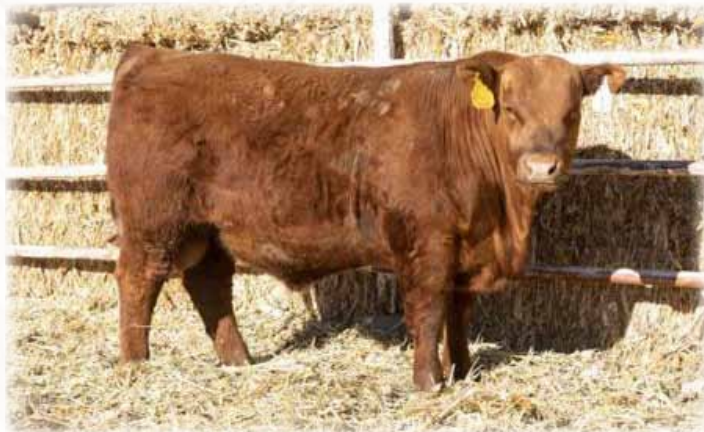
Texas Hold'em 85-1103

3929 has as good of a cow behind him as any bull in this sale. Turning 10 this year she still has an amazing udder and outstanding feet.