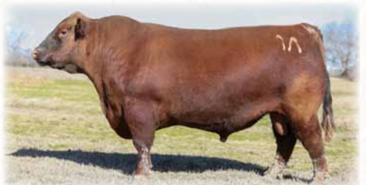
Wedel Comerstone 0224H - Sire of Lots 23-29

Wedel Comer Stone 0224H delivers elite marbling, spread, and fertility just like his sire Genuine, but he adds superior feed efficiency, breed-leading yield grade, superior REA, and outstanding foot structure.